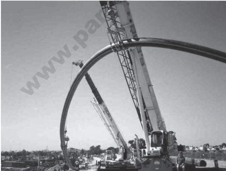
Figure 3 Butt Fused PE Pipe “Arched” for Insertion into Directional Drilling Installation