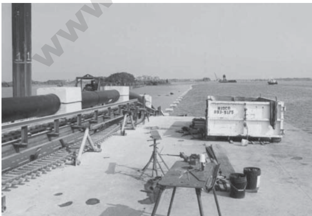
Figure 4 PE Pipe Weighted and Floated for Marine Installation