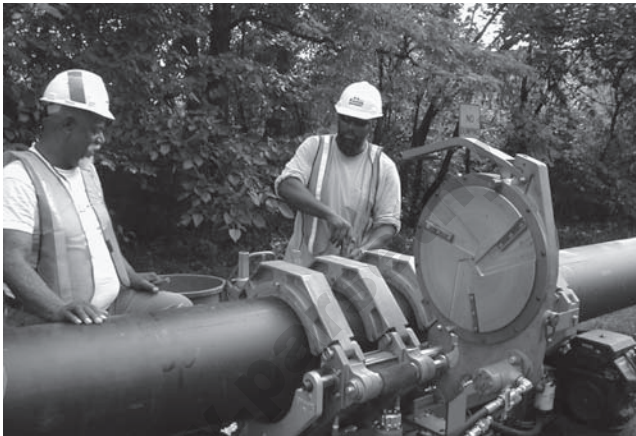
Figure 1 Joining Large Diameter PE Pipe with Butt Fusion

Since its discovery in 1933, PE has grown to become one of the world's most widely used and recognized thermoplastic materials.(1) The versatility of this unique plastic material is demonstrated by the diversity of its use and applications. The original application for PE was as a substitute for rubber in electrical insulation during World War II. PE has since become one of the world's most widely utilized thermoplastics. Today's modern PE resins are highly engineered for much more rigorous applications such as pressure-rated gas and water pipe, landfill membranes, automotive fuel tanks and other demanding applications.