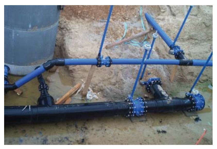
Photo 9: Fittings being fixed in the fire main and drinking water pipe

When the project was finished, the pipelines were subjected to pressure tests with a testing pressure of PN +5 bar. The fire main was tested with a testing pressure of 21 bar. Except for one leaky flange joint, which was repaired by tightening the bolts, the pressure tests proceeded without any faults.