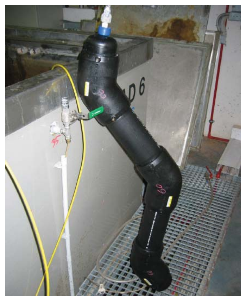
Photo 4: Internal (burst) pressure test at a testing stand in accordance with FM standard 1610

These tests must be carried out in two phases every 8 hours. During the first step the components are pressurised with double operating pressure for 5 minutes. There must not be any leaks or permanent deformations during this phase. Then the pressure is increased to the fourfold operating pressure during the second phase. It must be possible to maintain this pressure for 5 minutes as well. Deformations and small leaks are admissible, but leaks that lead to a pressure drop or failure of the components themselves mean that the test was not passed.