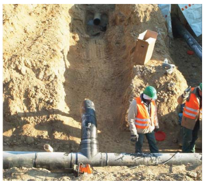
Photo 7: Branch from the main pipeline (DN 300) to the sprinkler sub-central room (DN 250)