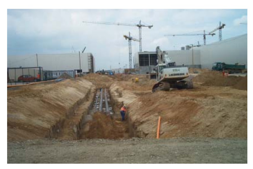
Photo 6: Parallel connecting pipeline to a sprinkler sub-central room

The installation of the supply pipes was largely completed by spring 2003 (Photos 6 to 9). The moulded parts used in the main pipe were constructed with short weld-on ends due to the dimension. Fittings (cast iron) were connected exactly like the adapters in the sprinkler sub-central room with flange joints.